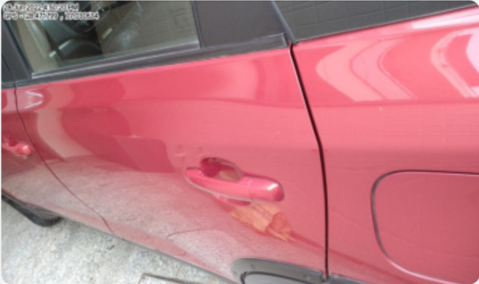
28-Jun-2022 4:50:20 PM Lat 28.4717993,Long 77.0306345