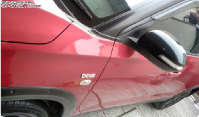
28-Jun-2022 4:50:34 PM Lat 28.4718241,Long 77.0306681