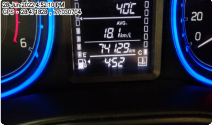
28-Jun-2022 4:52:10 PM Lat 28.471828,Long 77.0307038