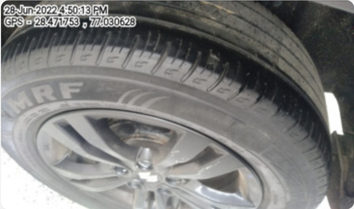
28-Jun-2022 4:50:13 PM Lat 28.4717527,Long 77.0306282