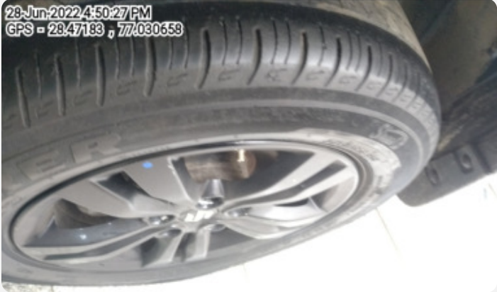
28-Jun-2022 4:50:27 PM Lat 28.4718298,Long 77.0306583