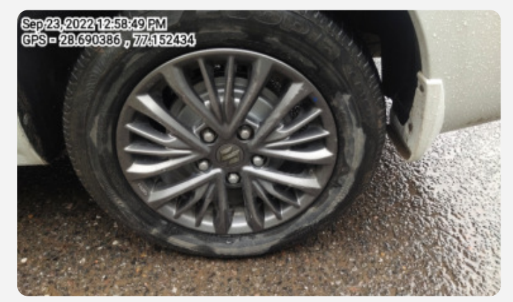
Sep 23, 2022 12:58:49 PM