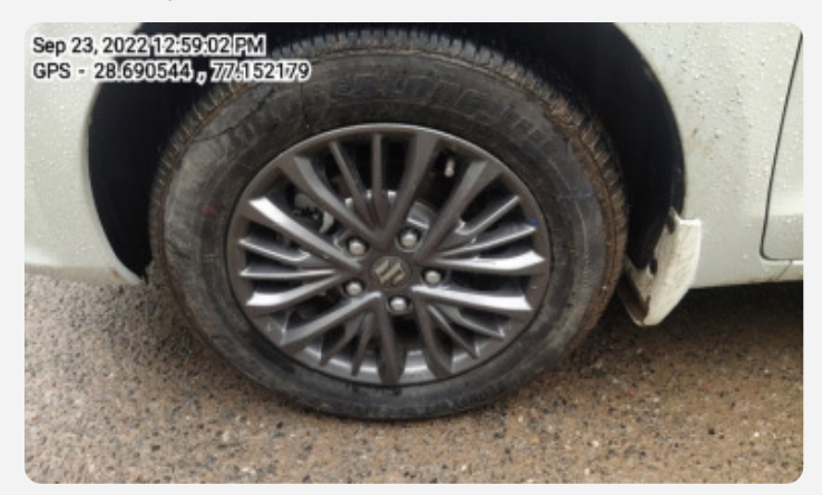
Sep 23, 2022 12:59:02 PM