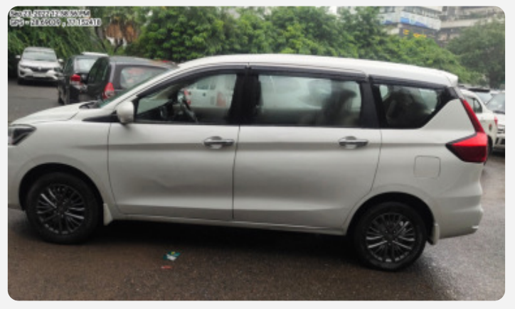
Sep 23, 2022 12:58:56 PM