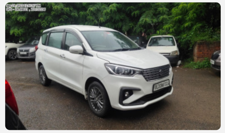
Sep 23, 2022 12:57:57 PM