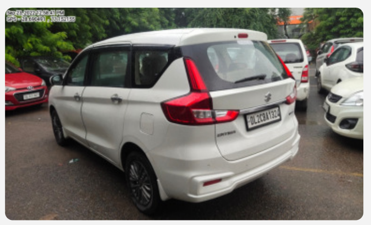
Sep 23, 2022 12:58:41 PM