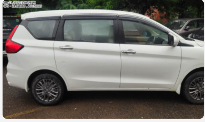
Sep 23, 2022 12:58:09 PM