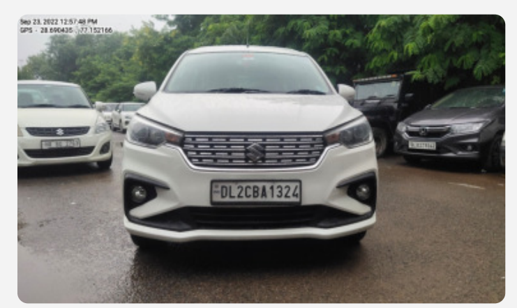
Sep 23, 2022 12:57:48 PM