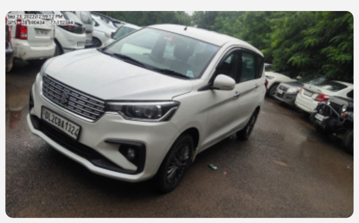
Sep 23, 2022 12:59:12 PM